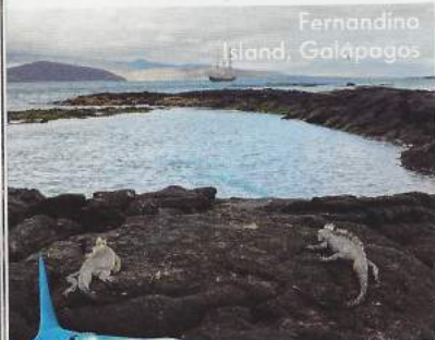
Fernandino Island, Galapagos