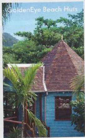
GoldenEye Beach Huts

CHILE Cruising the glorious Chilean fjords—unreachable by road—to see whales, dolphins and Magellanic penguins (seabourn.com). Then flying from Santiago to Easter Island, 3,700km off the Chilean coast and one of the most remote, fascinating places on earth: 887 monolithic stone figures carved by Polynesians. Stay at the five-star Explora Rapa Nui (plansouthamerica.com).