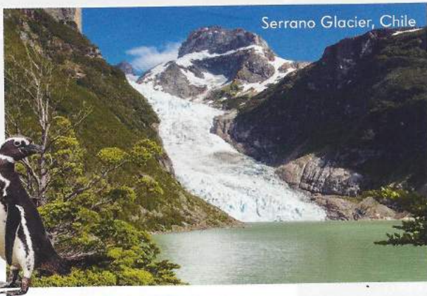
Serrano Glacier, Chile

CHILE Cruising the glorious Chilean fjords—unreachable by road—to see whales, dolphins and Magellanic penguins (seabourn.com). Then flying from Santiago to Easter Island, 3,700km off the Chilean coast and one of the most remote, fascinating places on earth: 887 monolithic stone figures carved by Polynesians. Stay at the five-star Explora Rapa Nui (plansouthamerica.com).