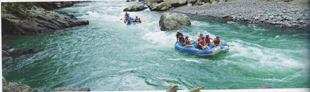
En route to Pacuare Lodge

COSTA RICA Going to Costa Rica to zip-wire through the rainforest and over volcanoes. There is a new direct BA flight to San José. Stay at Pacuare Lodge—reached by white-water raft; then indulge yourself at Hacienda AltaGracia, Central America's largest spa, with its own airstrip and helipad. Each bedroom is a casita with a private butler. Blacktomato.com are specialists in Costa Rican adventures, from volcanoes to powder-white beaches.